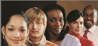
Training - Safety, Diving, First Aid, Access