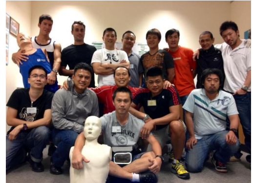
DMTR, Singapore (21 - 25 Jan 2013)