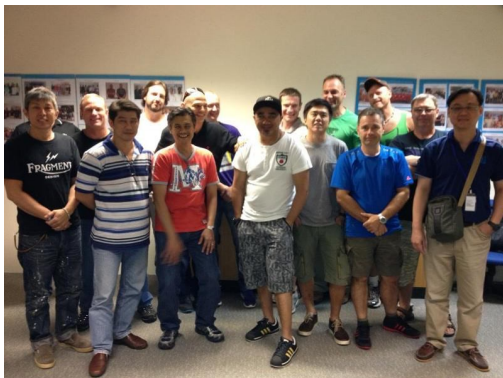
DMTR, Singapore (18 - 22 Feb 2013)