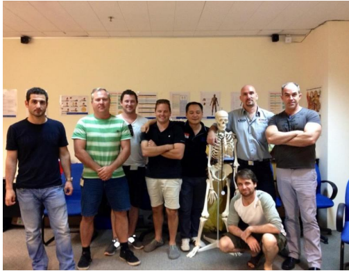
DMT, Singapore (28 Jan - 8 Feb 2013).

Click Here for the flyer or Contact us for more information.